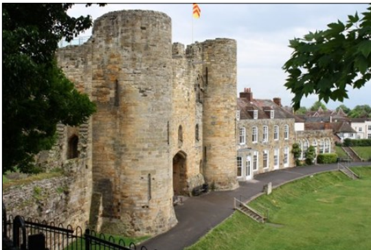
Tonbridge Castle – 21 July walk