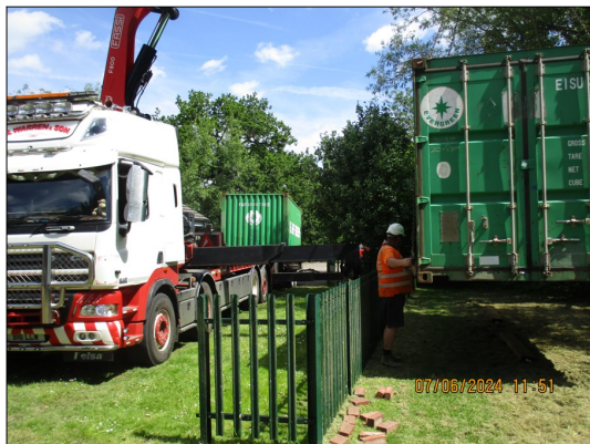
Delivery of containers at Potters Mede arranged by the Parish Council to provide storage for the Scouts' equipment.